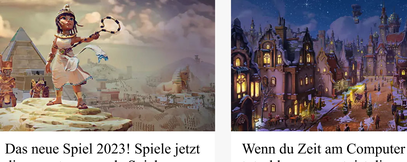
dieses entspannende Spiel.