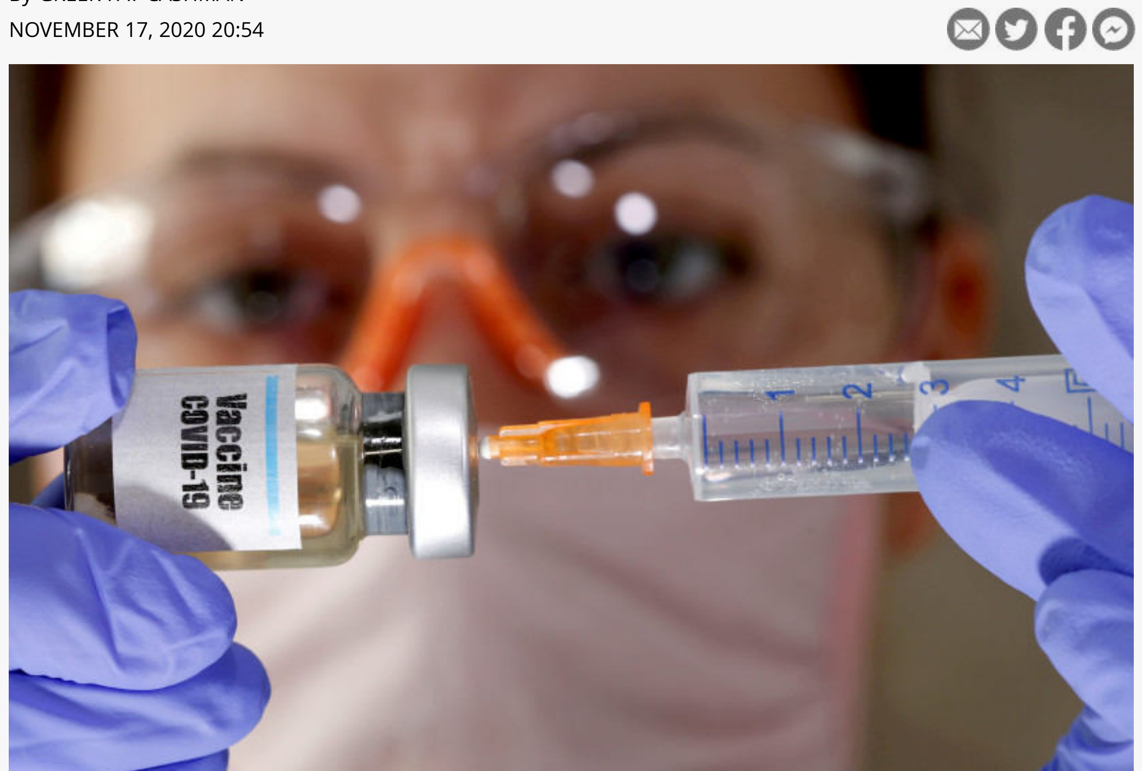
A woman holds a small bottle labeled with a "Vaccine COVID-19" sticker and a medical syringe in this illustration taken April 10, 2020.