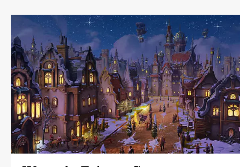
totschlagen musst, ist dieses...