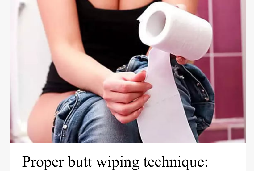
Boost your health with expert tips